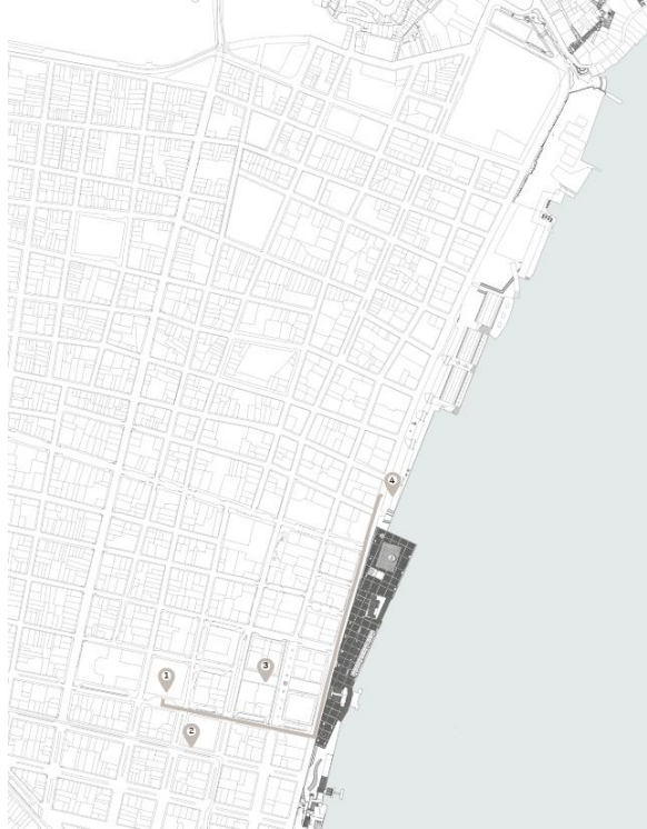
Fig. 1. Connection of Cultural Spaces. Note: Prepared by the authors.

It consists of joining strategic points where culture is carried out through an extensive route where the facilities and cultural facilities that surround the streets the center of Guayaquil will be taken advantage of to create a route that covers the following points: Urban Art Gallery Street, Centennial Park, Seminary Park, Municipality of Guayaquil, University of the Arts, Nahim Isaías Museum, Malecón 2000, Aerial road, Huancavilca Central Park.