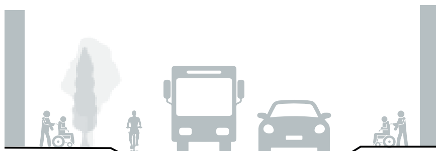
Fig. 3. Multimodal Street - 2. Note: Prepared by the authors.

The importance of Avenida Simón Bolívar in Guayaquil for commercial and residential purposes is well known. Numerous businesses, shops, restaurants, shopping malls, and residential structures can be found in parts of the city; it is also a crucial route for public and private transportation. In addition, it has wide sidewalks and vegetation, making it a pleasant place to walk and enjoy the surroundings.